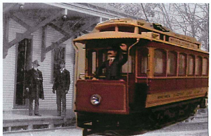
Car #16, the winter car is stopped for passengers at the King station.